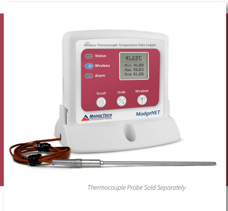
Thermocouple Probe Sold Separately

Wireless Thermocouple Temperature Data Logger