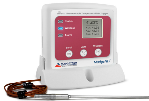
Probe Sold Separately

The RFTCTemp2000A is a wireless thermocouple based data logger with digital display. The device measures ambient temperature, as well as remote temperature via a thermocouple (sold separately), making it ideal for monitoring perishable goods, vaccine storage, chemicals and more. Starting, stopping and downloading from the device are all performed wirelessly using the RFC1000 wireless transceiver, allowing users to spend less time maintaining the data logger. Data can be provided in real time back to a central PC, or the device may be downloaded at period intervals.